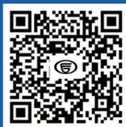
[Made in China]